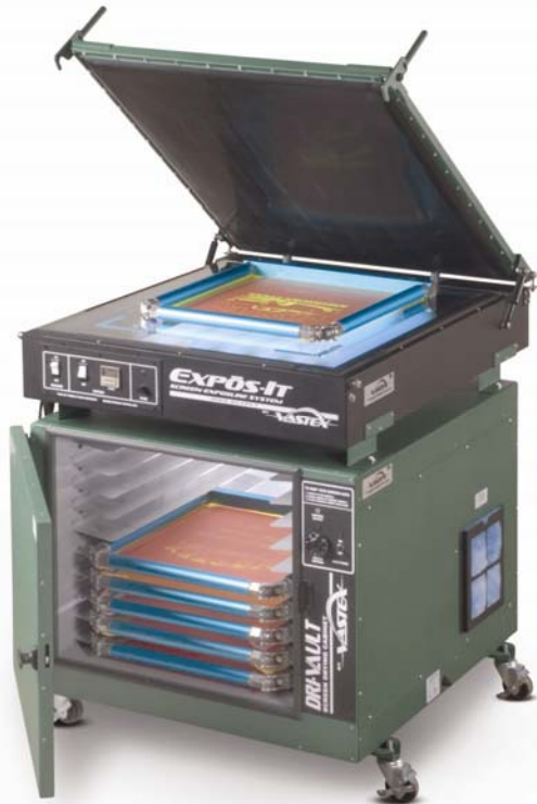
EXPOSIT model# E2331 and DRIVault model# VDC-243410 Combo, includes wheels