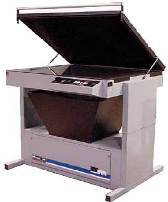
Metal Halide Exposure unit AM-150

Touch Activated, User Friendly Keypad & LED Digital Display