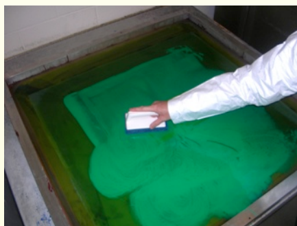
Step 2. Scrub ink with a non-absorbent pad until liquified.