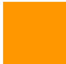
UPLC0151 G2 SPORT LC TN ORANGE