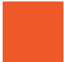
UPLC0172 G2 SPORT LC ORANGE