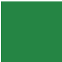
UPLC0356 G2 SPORT LC GREEN