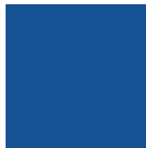
UPLC0661 G2 SPORT LC ROYAL